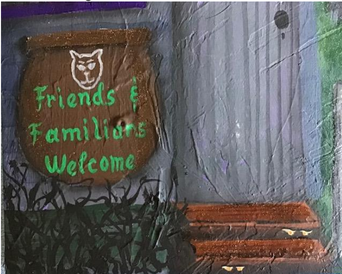
Pic 8 – Sign and stairs