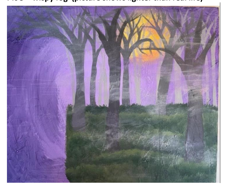
Pic 5 – wispy fog (picture shows lighter than real life)