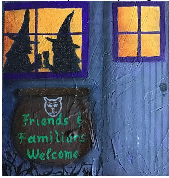
Pic 7 – Windows (with witches) and sign